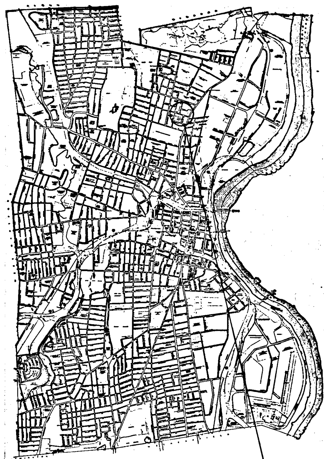
LOCATION PLAN Scale: 1"=3200'